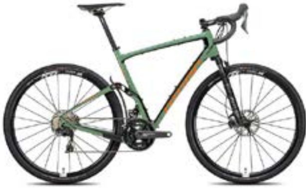
OLIVE GREEN / ORANGE