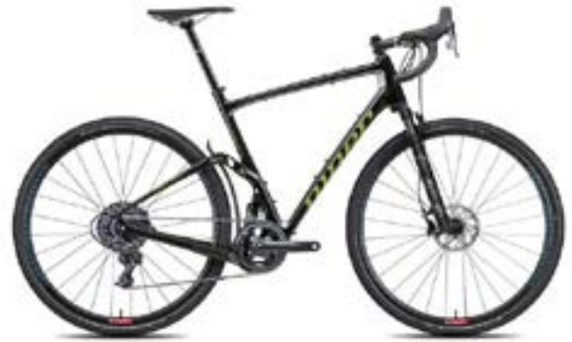
BLACK / MAGNETIC GREY

For a budget-friendly, gravel-specific build kit, look no further than our 2-Star SRAM Apex 1 single chainring setup. With Niner wheels, Schwalbe tires, and a SRAM drivetrain, it's a value-priced gravel-grinding package.