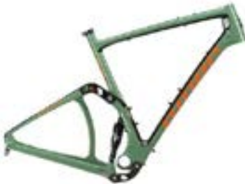
OLIVE GREEN / ORANGE