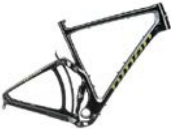
BLACK / MAGNETIC GREY